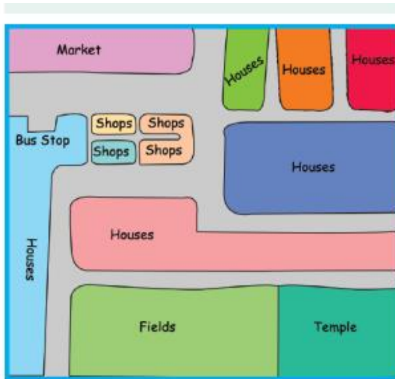
Fig 3.1 A model of a sketch